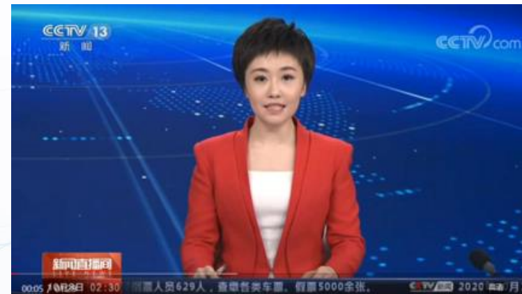
CCTV Live News Room, Oct. 3