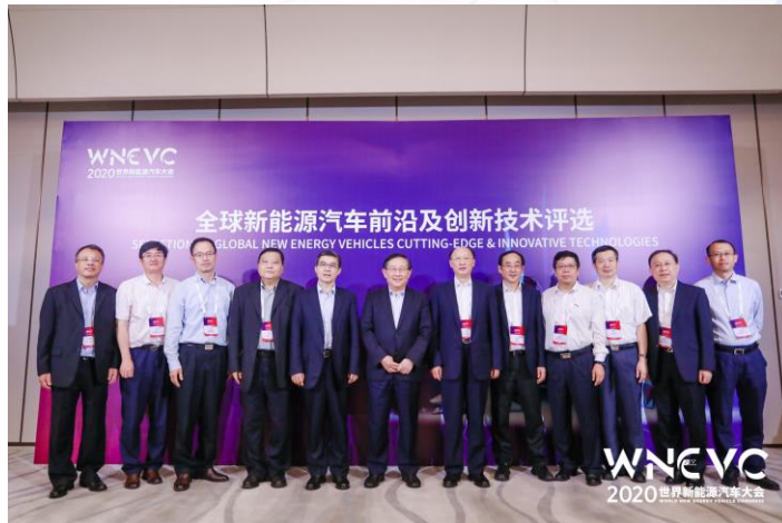
Technology Selection Symposium