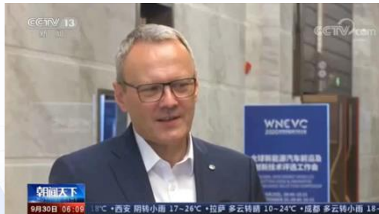
CCTV Morning News, Sept. 30