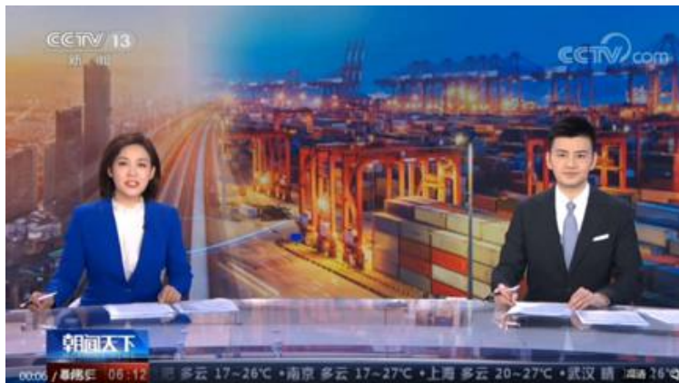
CCTV Morning News, Sept. 30